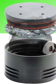
Groundhog G-8 Sensor