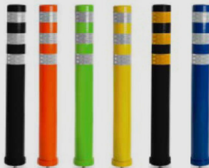
Available in a Range of Colours

VeloFlex Screw-In Reboundable Bollards are ideal for Cycle Lane delineation. They have a small footprint so when installed on the carriageway or footpath take up a minimal amount of space. They are soft and forgiving if a cyclist accidentally collides with the bollard but are also very durable and will survive multiple impacts from passing vehicles. They are fast and easy to install and this minimises the amount of time the installer working on a live road, thus improving safety for the installation crew. Their ability to survive multiple impacts means they offer exceptional value and will continue to function for extended periods.