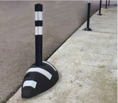
Tiger separator can be used in conjunction with FG300 Impact Resistant Bollards for enhanced cycle lane delineation.